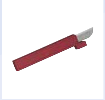
10 pcs. blades for S10.3311