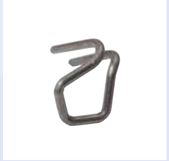
9,5 mm eyelet for 84.931