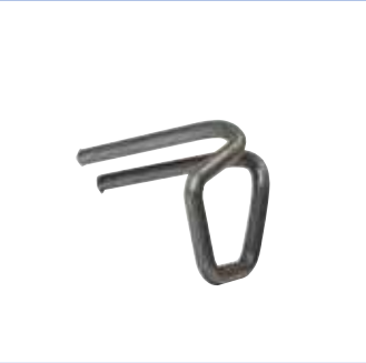
10,5 mm eyelet for 84.931