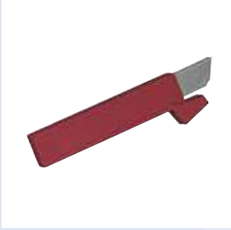
10 pcs. blades for S10.3312