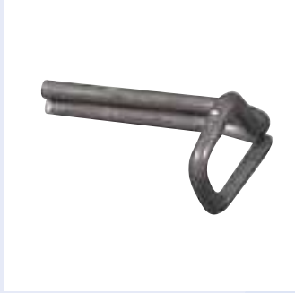
7 mm eyelet for 84.931