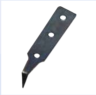
Cold cut knife blade for 84.840084. 19 mm.