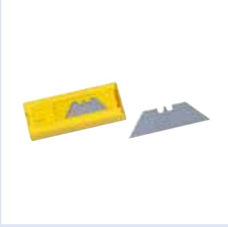
10 pcs. blades for S10.3301