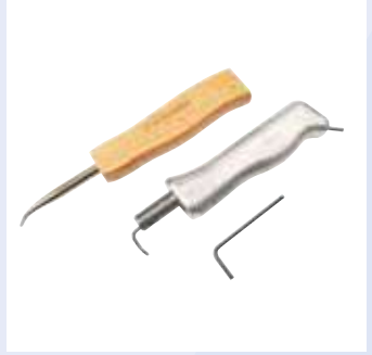
Tool set for inserting filler sections in glazing sections. Eyelet Ø 9,5 mm.