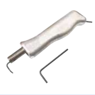
Tool for filler sections