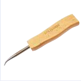
Tool for glazing sections with wooden handle