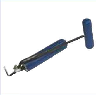
Cold cut knife